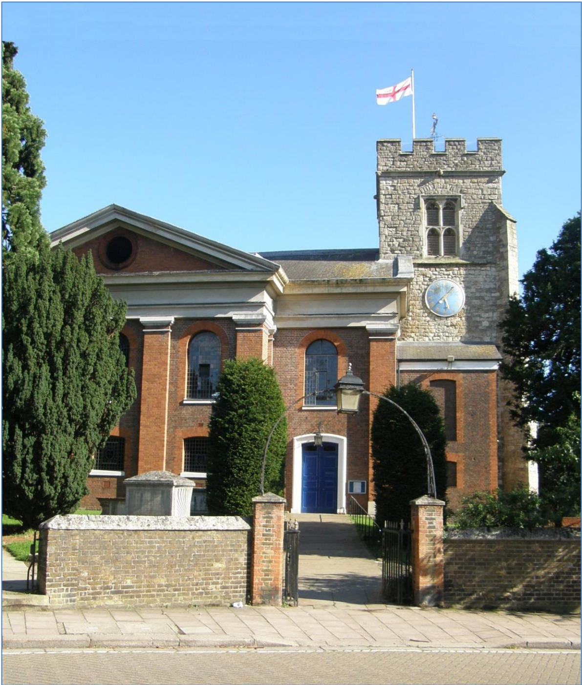
August 2017